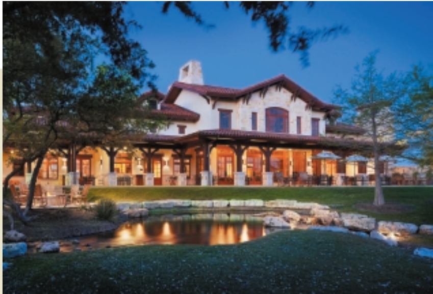
The University of Texas Golf Club Austin, Texas

All Services Can Be Provided Under One Contract