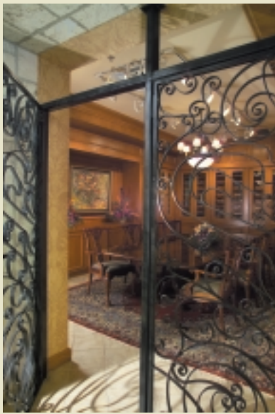
The Country Club of Coral Gables Coral Gables, Florida

The CCI design portfolio of award-winning private golf and country clubs, city clubs, and yacht clubs has grown from its Texas origins to encompass over 500 clubs throughout the United States, North America, the Caribbean and North Africa.