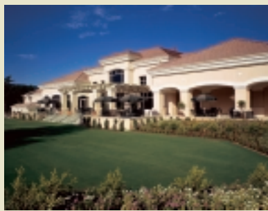
Round Hill Country Club Alamo, California