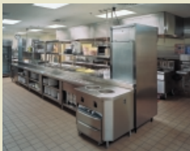
The Golf Club at Lansdowne Resort Leesburg, Virginia