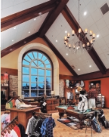
The Golf Club at Lansdowne Resort Leesburg, Virginia

Clubs are unusual organizations requiring a combination and variety of skills such as planning and design, architecture, food and beverage design, interior design, and construction management. No individual, and very few companies in the world, provide the breadth of experience and skill required. Fewer still have the experience of applying these skills successfully to the unique club cultures within the United States and North America. For over 35 years, CCI has developed operating systems, a dynamic planning and design approach, an experience base and a dedicated core of highly trained and motivated people that has enabled it to successfully design private clubs for discerning members.