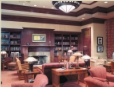
The Woodlands Country Club - Palmer Clubhouse The Woodlands (Houston), Texas