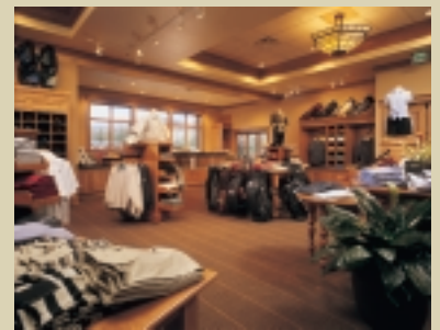
ArrowCreek Country Club Reno, Nevada