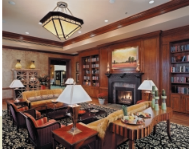
The Golf Club at Lansdowne Resort Leesburg, Virginia

Serving the club industry and its members for over 35 years