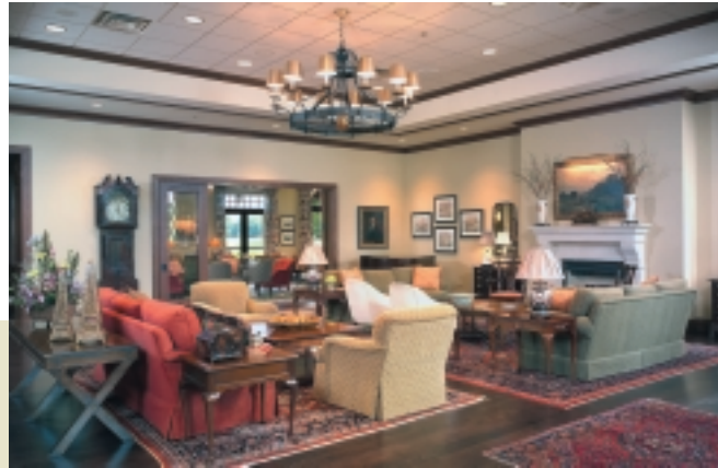
Sunset Ridge Country Club Northfield (Chicago), Illinois

Comprehensive design services provided seamlessly and conveniently from a single source