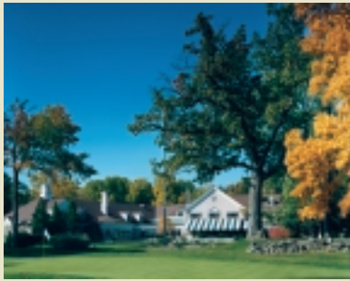
Country Club of Rochester Rochester, New York