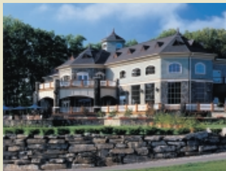
Saratoga National Golf Club Saratoga Springs (Albany), New York

Communication, documentation, and quality control ensure successful projects through use of modern technologies, such as the Internet. This enables optimum control and facilitates communications among the owner, the architect and the contractor. CCI has designed clubs from Hawaii to Virginia, from Maine to Puerto Rico, and Canada to North Africa. No project is more than a day trip away, and each receives the same level of scrutiny. Extensive construction drawings and comprehensive construction specifications, based on over three decades of club experience, provide the contractor with explicit instructions about materials, systems, and construction details. Computer aided design (AutoCAD) enhances the accuracy of the drawings and allows our library of specialized club details to be incorporated with ease. Our specifications require the contractor to submit fabrication drawings, material samples, and mock-ups so that quality can be monitored during construction. These methods are utilized no matter where the project is located. On major remodeling projects, we provide a local liaison architect for detailed monitoring during construction.