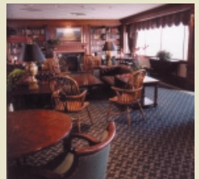
Park City Club Dallas, Texas