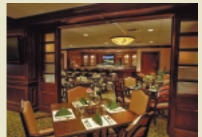
Bent Tree Country Club Dallas, Texas