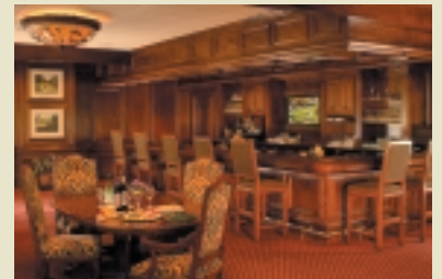
Hillwood Country Club Nashville, Tennessee