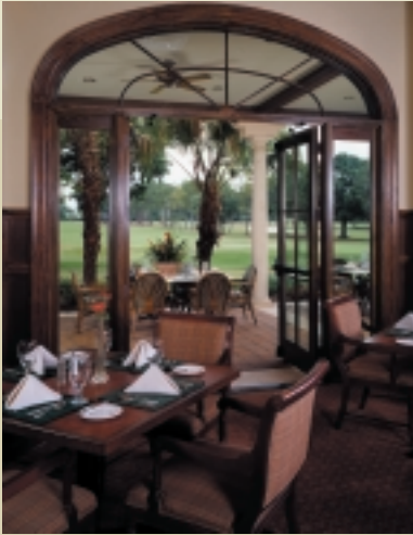
The Country Club of Orlando Orlando, Florida