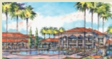
Sonatrach Petroleum Club, Hotel & Spa Algiers, Algeria