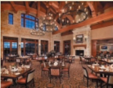
The University of Texas Golf Club Austin, Texas