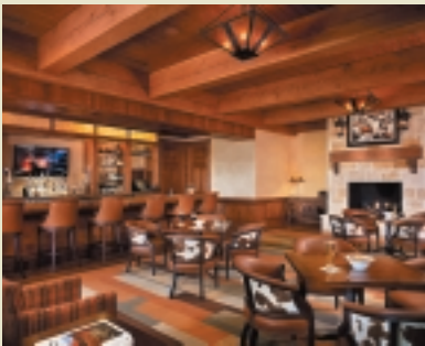
The University of Texas Golf Club Austin, Texas