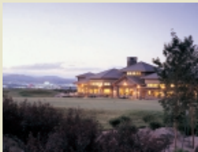
ArrowCreek Country Club Reno, Nevada

At CCI we believe club ambience should reflect the style and taste of its members. That is why CCI's talented team of interior designers gives a careful consideration to all needs and desires of the membership revealed through focus groups, meetings, and membership surveys. CCI has one of the most comprehensive in-house interior design libraries with resources for color schemes, fabrics, furniture, carpet, and lighting accessories. Regardless of the project size, each client will receive the same high level of personal commitment and dedication to true quality. Whatever the time, whatever the style of the clubhouse, traditional or contemporary, the most important thing for CCI's designers is to create a "home away from home" for the membership within the budget!