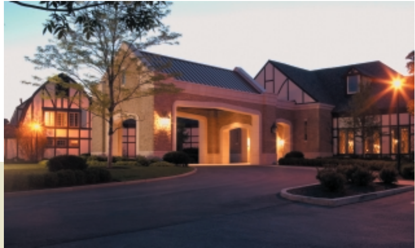
Sunset Ridge Country Club Northfield (Chicago), Illinois