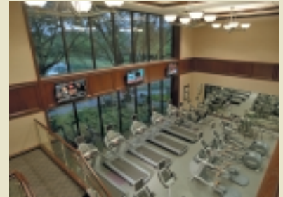
Bent Tree Country Club Dallas, Texas

You cannot go wrong if you listen to the club members