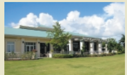
Palmas Del Mar Resort Humacao, Puerto Rico