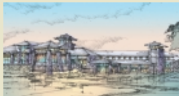
Blue Devil Golf Course Calgary, Alberta, Canada

Our ability to utilize global consultants for mechanical, electrical, and structural engineering was proven once again by the Algerian project. CCI worked closely with engineers in Montreal, Paris, and Algiers to coordinate and produce the construction documents for a general contractor based in Boston and Algiers- a truly international facility.