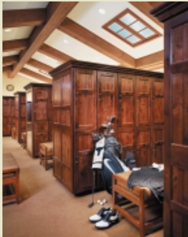
The University of Texas Golf Club Austin, Texas