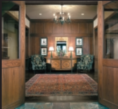
Sunset Ridge Country Club Northfield (Chicago), Illinois